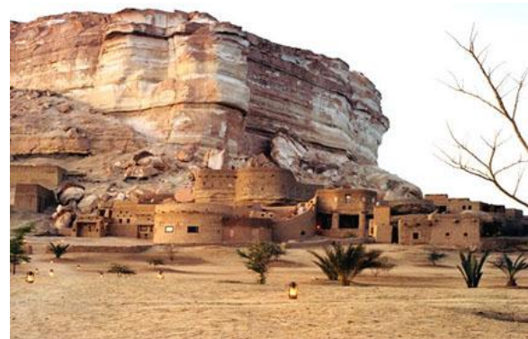
Figure 7 Adrere Amellal at the Foot of the White Mountain– Siwa – Egypt