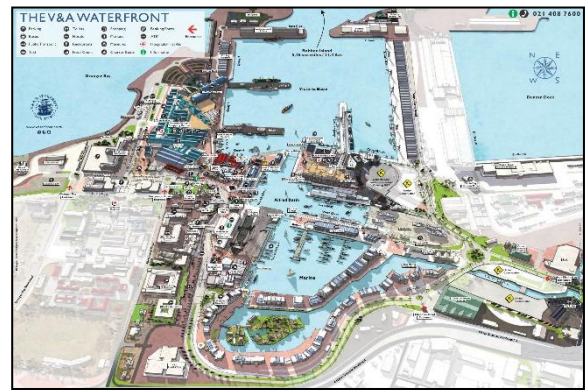
Figure 6 The V&A Waterfront map