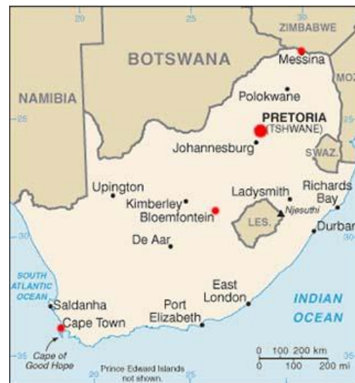
Figure 3 Cape Town location

Infrastructure in South Africa is developed and serves almost 45 million people. The population is Miscellaneous with different cultural and ethnic backgrounds. English is one of many spoken languages. The Western Cape has had an unceasing 3% annual economic growth rate over the past decade 2 .