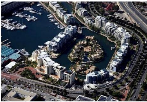
Figure 1 Aerial views of V&AW Residential and Marina basin in 1980s and 2012.

New master plans were set to develop the fishing and shipping harbor to turn out to witness a distinguish waterfront transformation: hotels, restaurants, shopping centers, fishing and shipping harbor and leisure attractions 2 .