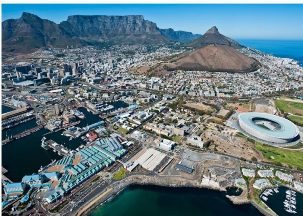
Figure 5 Aerial view of the V&AW