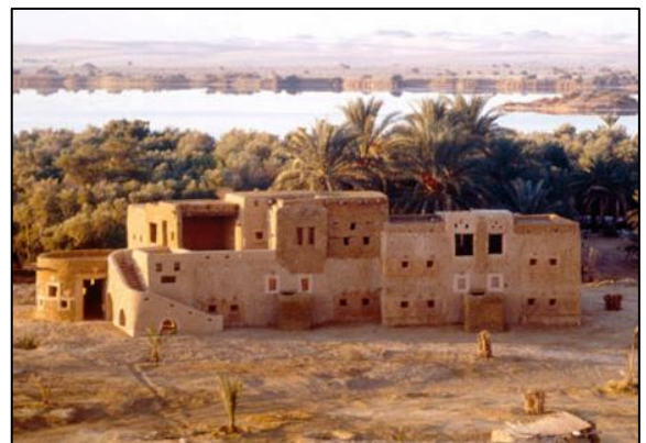
Figure 8 Cluster of suits at Adrere Amellal – Siwa – Egypt