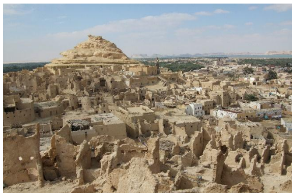
Figure 2 Old town of Shali in Siwa Oasis– Siwa – Egypt.

On the other hand, Siwa Oasis, Egypt lies in the western desert, only 300 km southwest of Marsa Matrouh 3 . Siwa had a historical background of temples, tombs and other remains. Siwa is famous of the Oracle of Amon and used to be considered as a religious center and destination for many leaders 4 . Siwa used to be a trade transit route for trade caravans. Siwa is famous of cultivating dates and olives, depends on water springs and has a salt lake 3 .